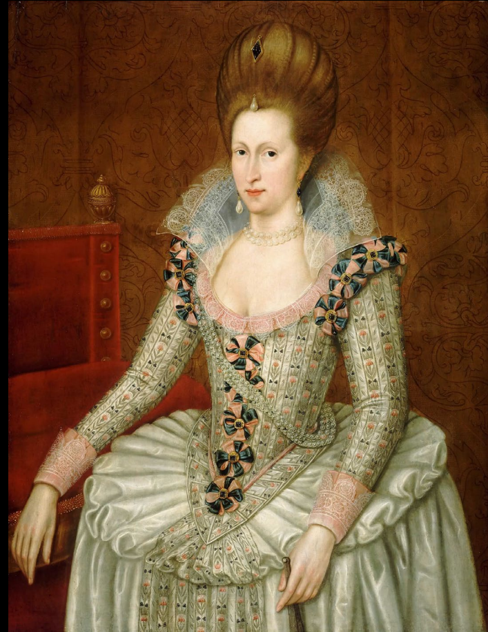
Queen Anna of Denmark

Marcus Gheeraerts the Younger c. 1600-1602