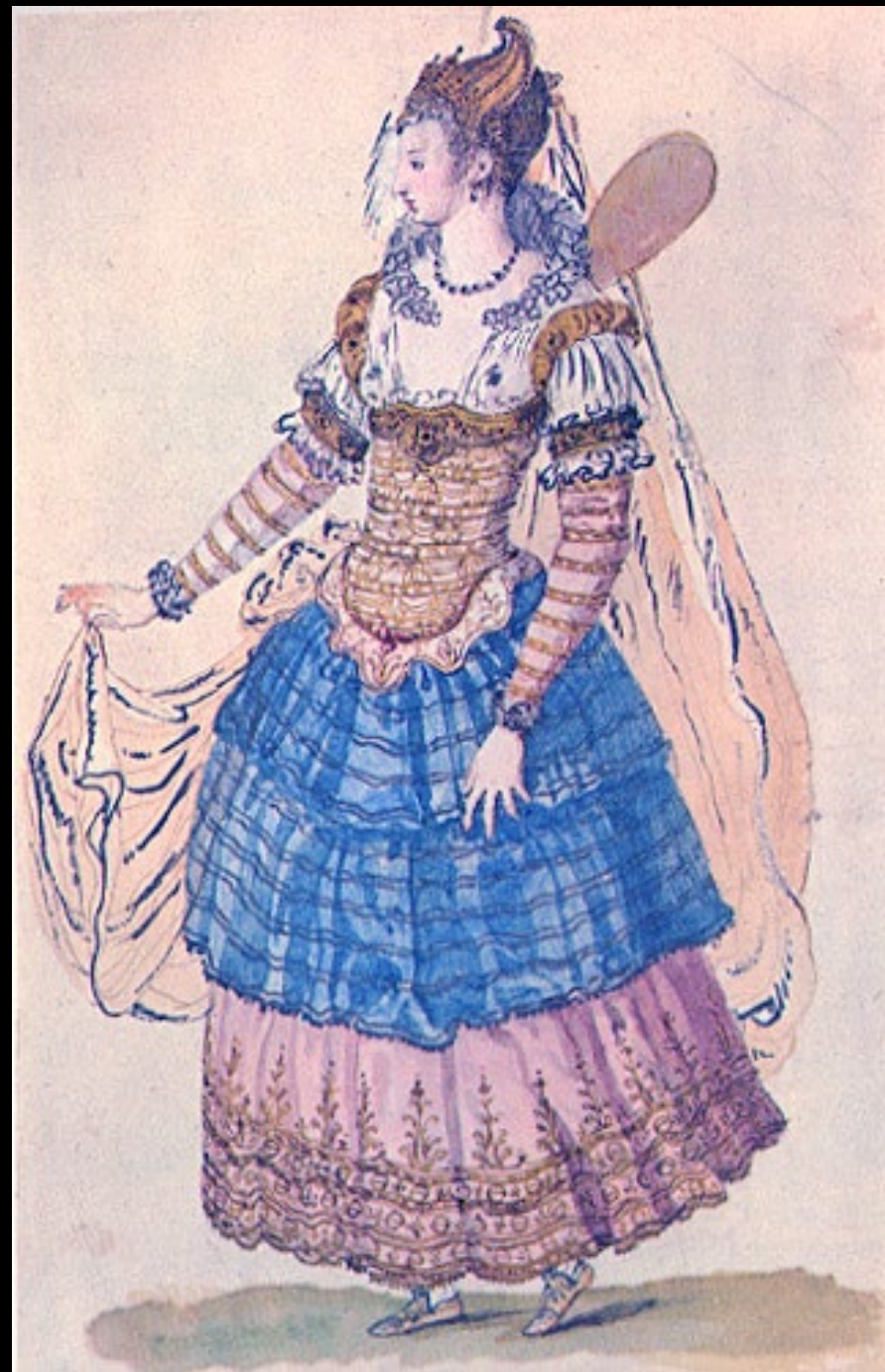
Costume Design by Inigo Jones Oberon (1611)