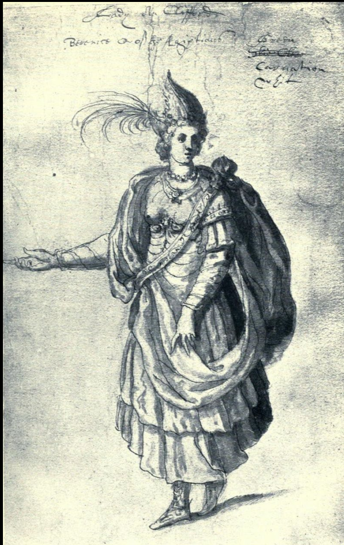
Queen Beronice The Masque of Queens