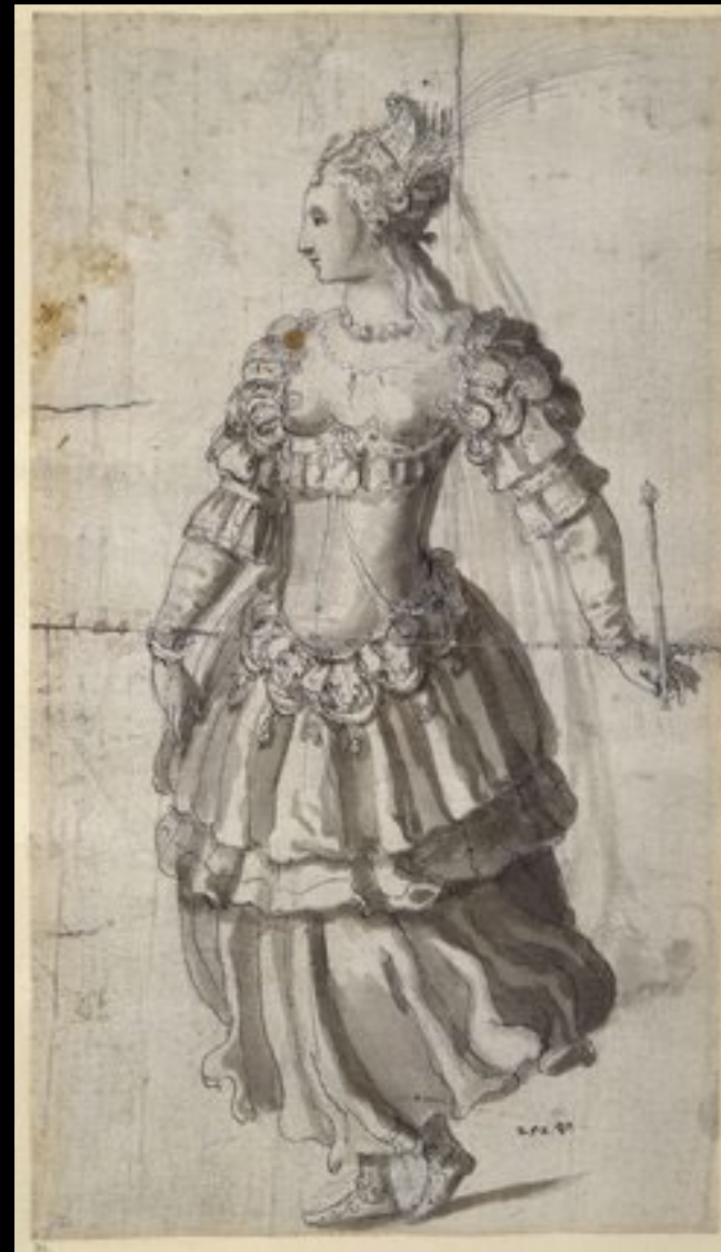
Unidentified Queen The Masque of Queens